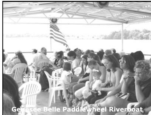
Genesee Belle Paddlewheel Riverboat

This Gift Card is redeemable for merchandise and food at: Genesee County Parks administrative office, Wolverine Campground, For-Mar Gift Shop, most locations at Crossroads Village & Huckleberry Railroad, and online purchases. Each time you use your card, your register receipt will indicate the balance remaining on your gift card. Purchases with the card will be deducted from the balance until it reaches zero. Genesee County Parks will not refund lost or stolen cards. This gift card cannot be redeemed for cash. All cancellation and refund policies apply. For all inquires, including card balance and customer service during normal business hours, Mon.- Fri, 8:00 am to 4:30 pm, call 810.736.7100, ext. 6 or 800.648.PARK, ext. 6. You may also consult the Genesee County Parks' website or send us an email with your comments and concerns to: parkswbteam@gcparks.org .