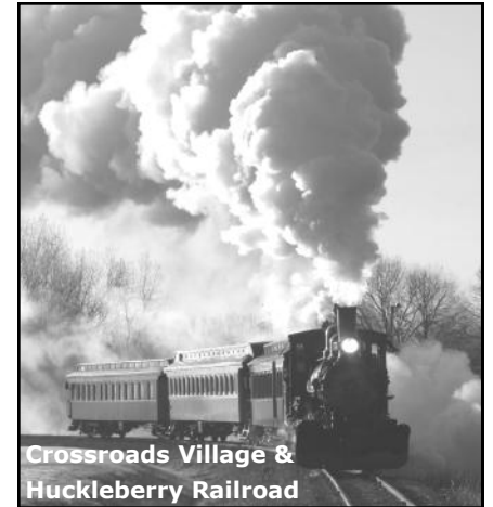
Crossroads Village & Huckleberry Railroad