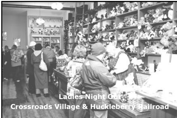
Ladies' Night Out Crossroads Village & Huckleberry Railroad