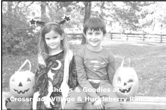
Halloween & Goodies at Crossroads Village & Huckleberry Railroad