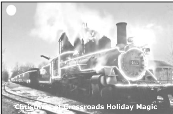
Christmas at Crossroads Holiday Magic